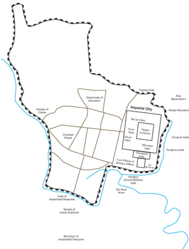
Nanjing during the Ming dynasty

When Ming troops overthrew the Mongols of the Yuan dynasty in 1368, the establishment of a capital city with an appropriate imperial presence became a high priority. The first Ming emperor settled in Nanjing on the lower reaches of the Yangzi River, an area that was China’s wealthiest and was home to many members of its educated elite. Nanjing (literally, “Southern Capital”) was the primary Ming capital until 1420, when the Yongle emperor (r. 1403–1424) moved the capital to Beijing (“Northern Capital”). For the remainder of the dynasty, Nanjing served as the secondary capital, with subsidiary administrative significance. The construction of each capital was an enormous undertaking, requiring the mobilization of massive labor forces and the amassing of great quantities of materials.