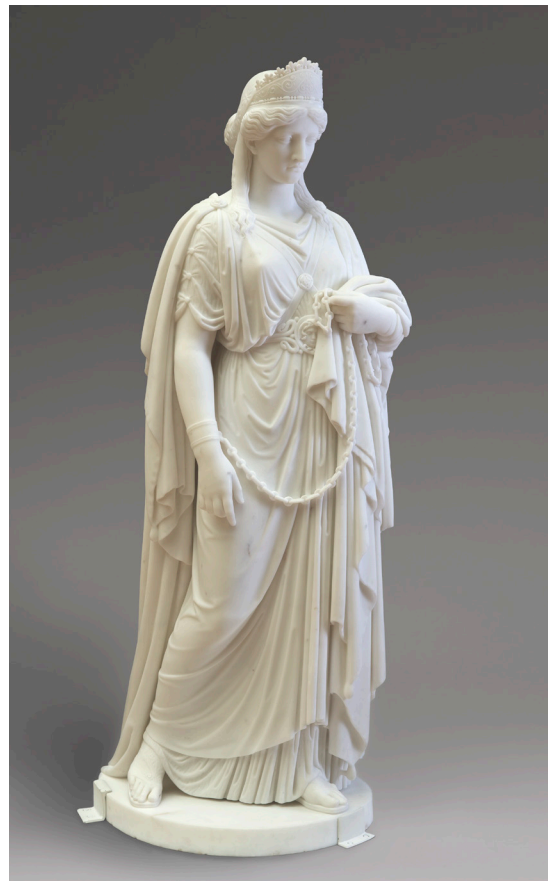
Harriet Goodhue Hosmer, American (active Italy), 1830–1908; Zenobia in Chains , c.1859; marble; 44 1/4 x 14 x 18 inches; Saint Louis Art Museum, American Art Purchase Fund 19:2008

30 Gallery 338 Daniel Interpreting to Belshazzar the Writing on the Wall , Benjamin West Frankie Peltier, AIFD, CFD and Josh Brower Festive Couture Floral